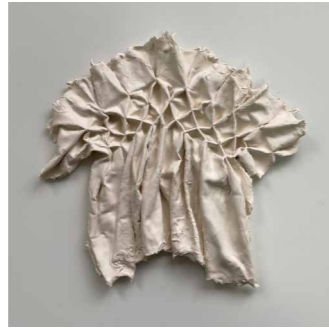
Small Size: 20 cm Price: 550 NIS