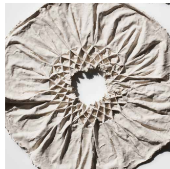
Large D: 36 cm Price: 1350 NIS