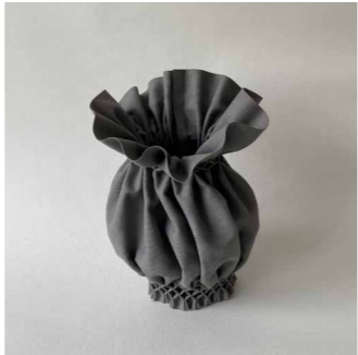
Small H: 30 cm Price: 650 NIS