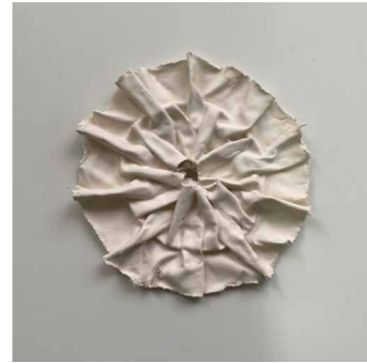
Small D: 15-19 cm price: 550 NIS