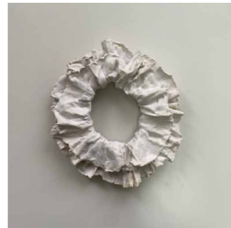
Small D: 17 cm Price: 750 NIS