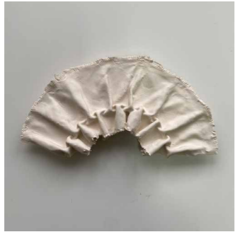
Big Size: 30 cm Price: 950 NIS