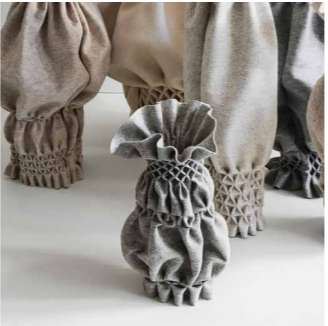
Small H: 60 cm Price: 2200 NIS