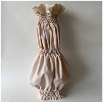
Tall H: 60 cm Price: 950 NIS