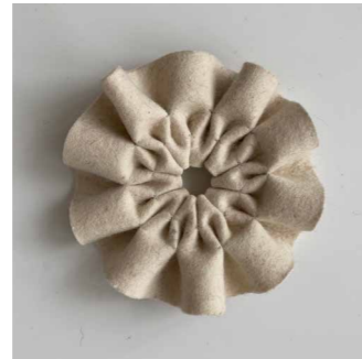
Medium D: 20-33 cm Price: 550 NIS