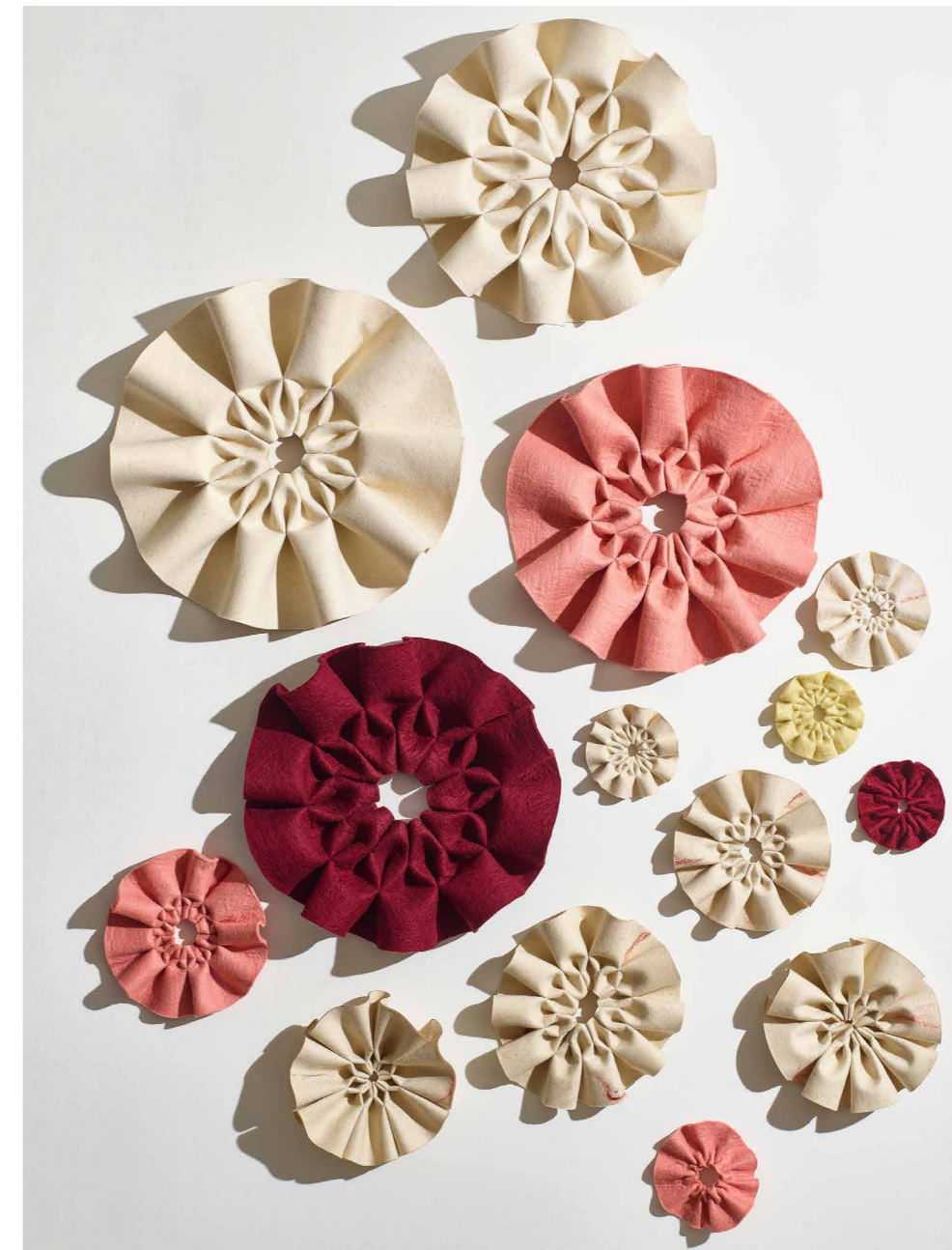
Material: 100% wool Felt