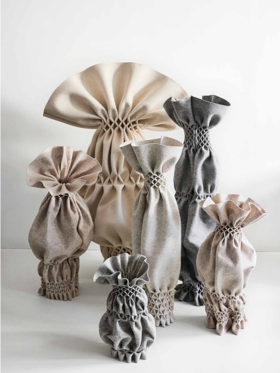
Material: 100% wool Felt