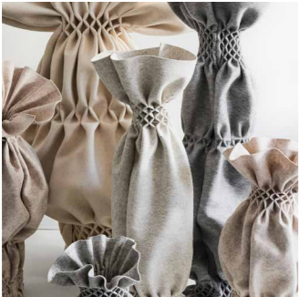
Big H: 150-130 cm Price: 8200 NIS