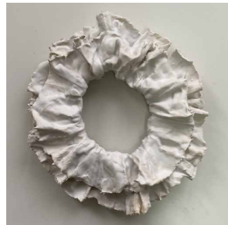
Big D: 20 cm Price: 950 NIS