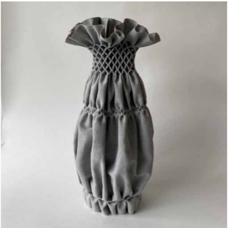
Medium H: 50 cm Price: 790 NIS