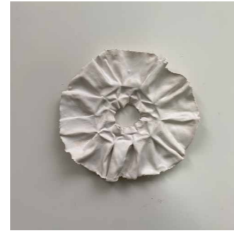
Tiny D: 10-13 cm price: 290 NIS