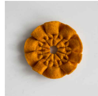
Small D: 13-16 cm Price: 290 NIS