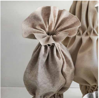
Meduim H: 120 cm Price: 6200 NIS