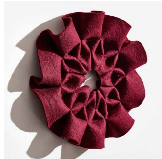
Large D: 53-62 cm Price: 1350 NIS