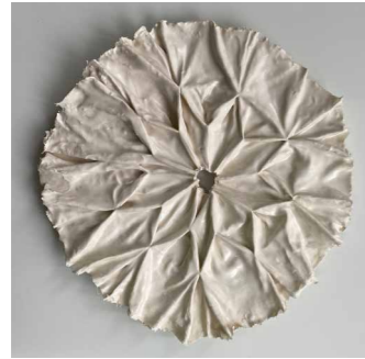
Big D: 28-33 cm Price: 950 NIS